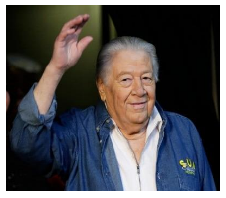
Clement - icon & my contemporary version